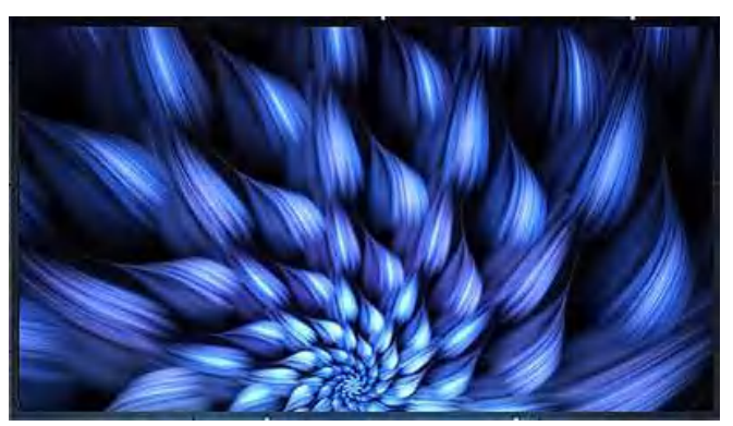
65 Inch Professional Monitor